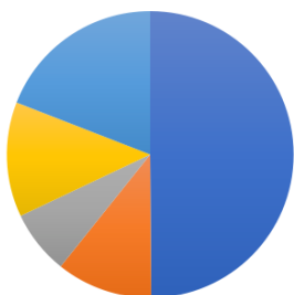
Mount Lebanon Ministry

■ Personnel ■ Admin Expense ■ Ministry Expense ■ Missions ■ Building Operations